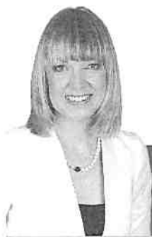
Hon Mia Davies MLA MEMBER FOR CENTRAL WHEATBELT