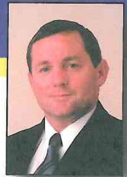
Member for Capel